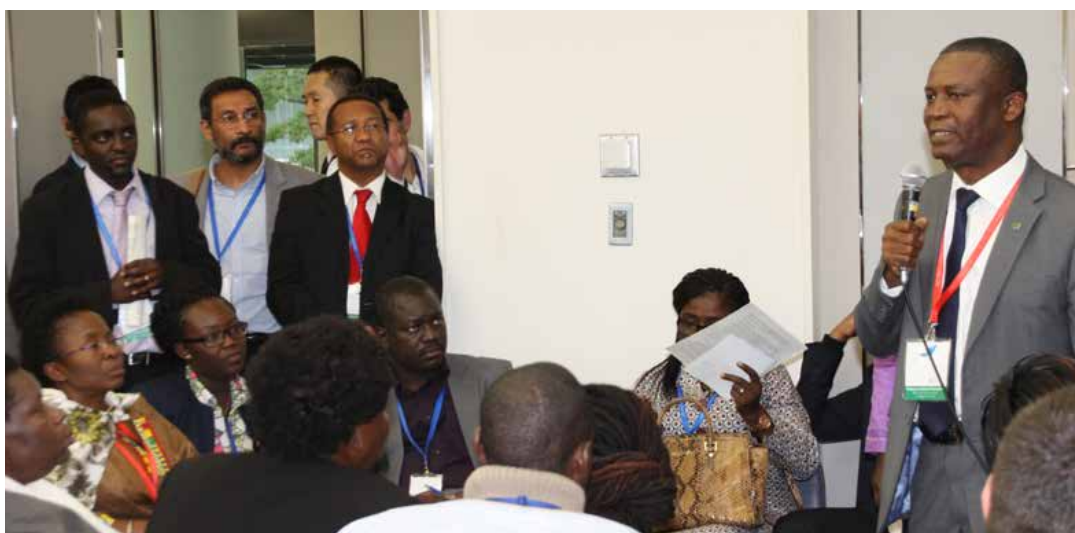
Dr. Shukuru Kawambwa, Minister for Education and Vocational Training of Tanzania, expresses his commitment to support youth initiatives in East Africa