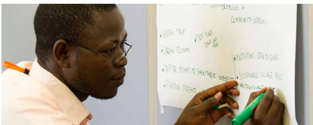
Parallel Workshop Sessions: Discussion Group 2