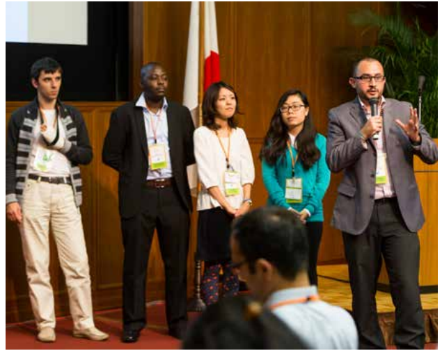
Discussion Group 4