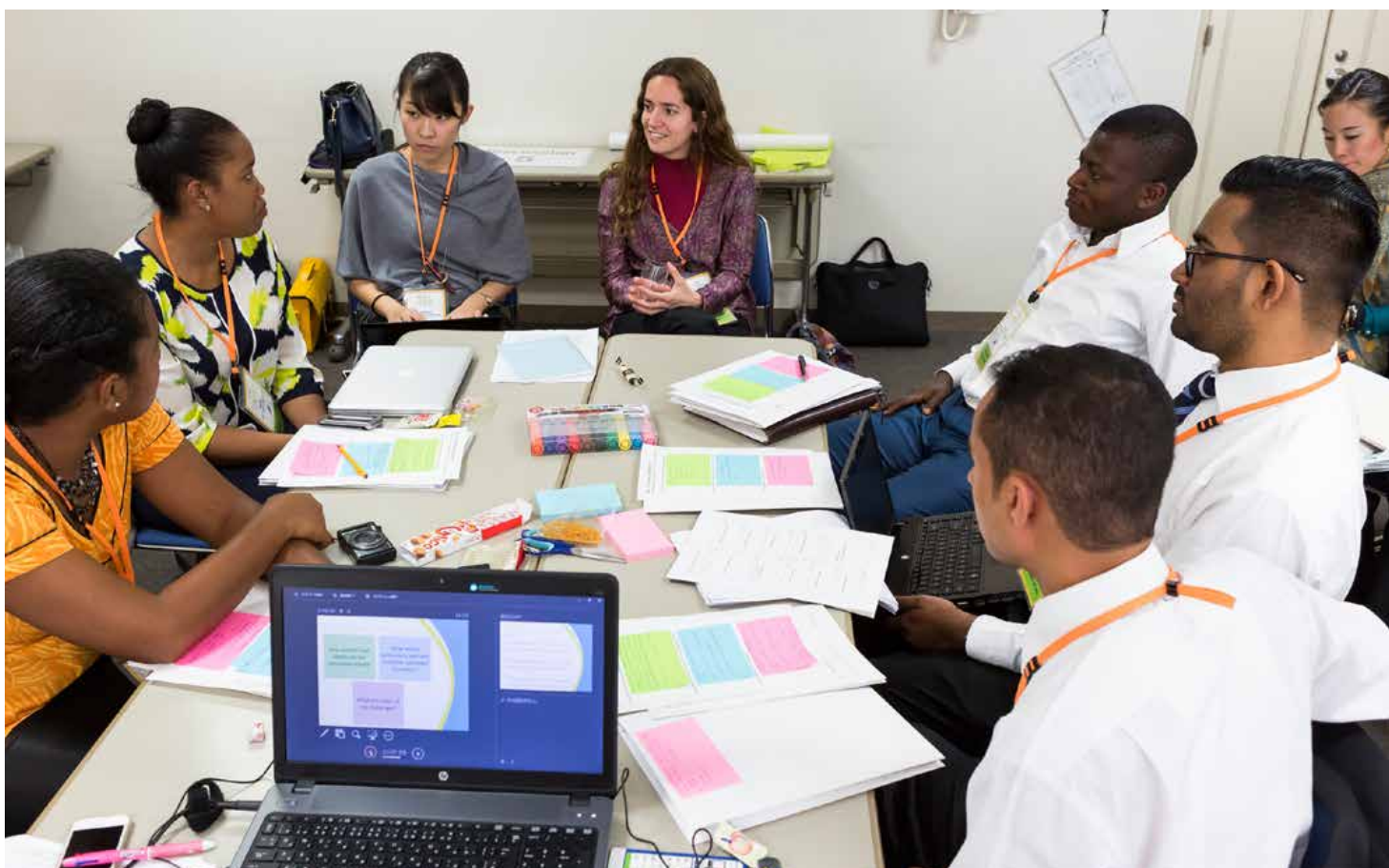
Parallel Workshop Sessions: Discussion Group 5