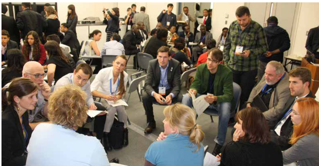
Intergenerational dialogue at the youth-organized side event