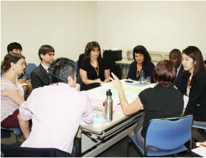
Discussion Group 3