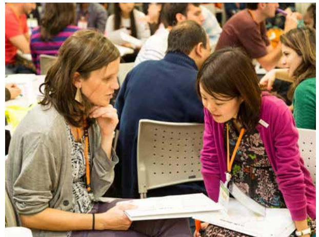
Participants get to know each other by telling the stories of their lives—both good times and challenging times