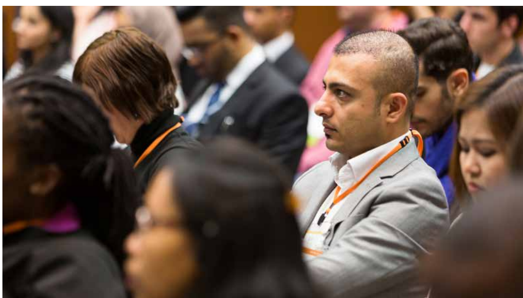
Participants at the Opening plenary session

And I pledge to you today, UNESCO will support you at every step in every way we can. We will see you next week at the UNESCO World Conference on Education for Sustainable Development, and we will build your vision into the 9th UNESCO Youth Forum in 2015.