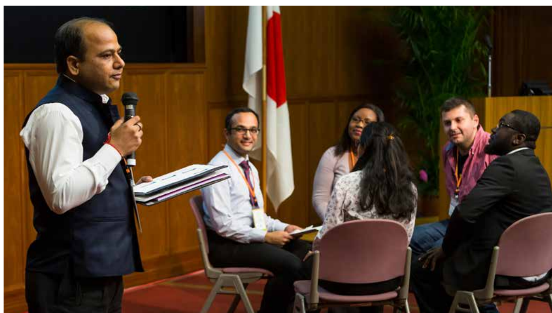
Discussion Group 1 presenting their recommendations through skits