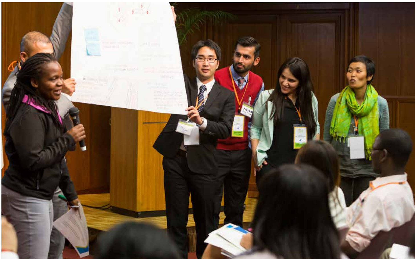
Presentation by Discussion Group 8