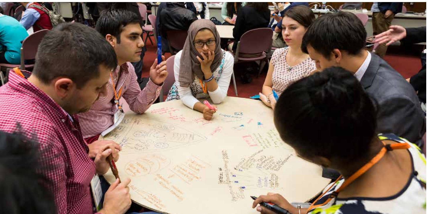
Group discussion using “Entakun”—a cardboard laptop desk

The following page lists some of the ideas that came out of the discussions.