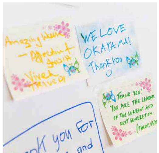
Messages to children in Okayama