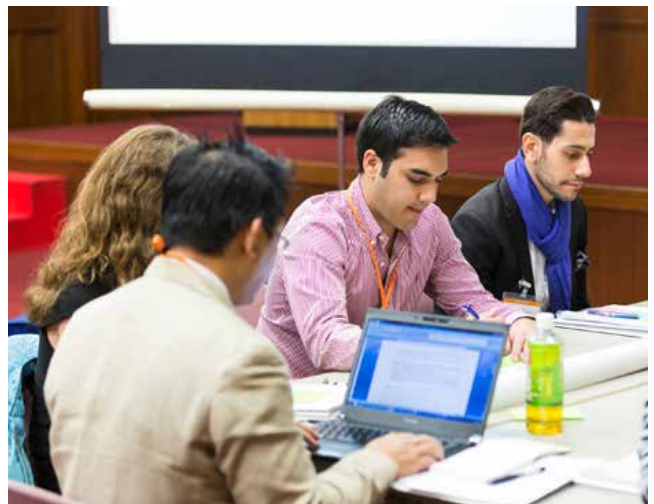
Discussion Group 7