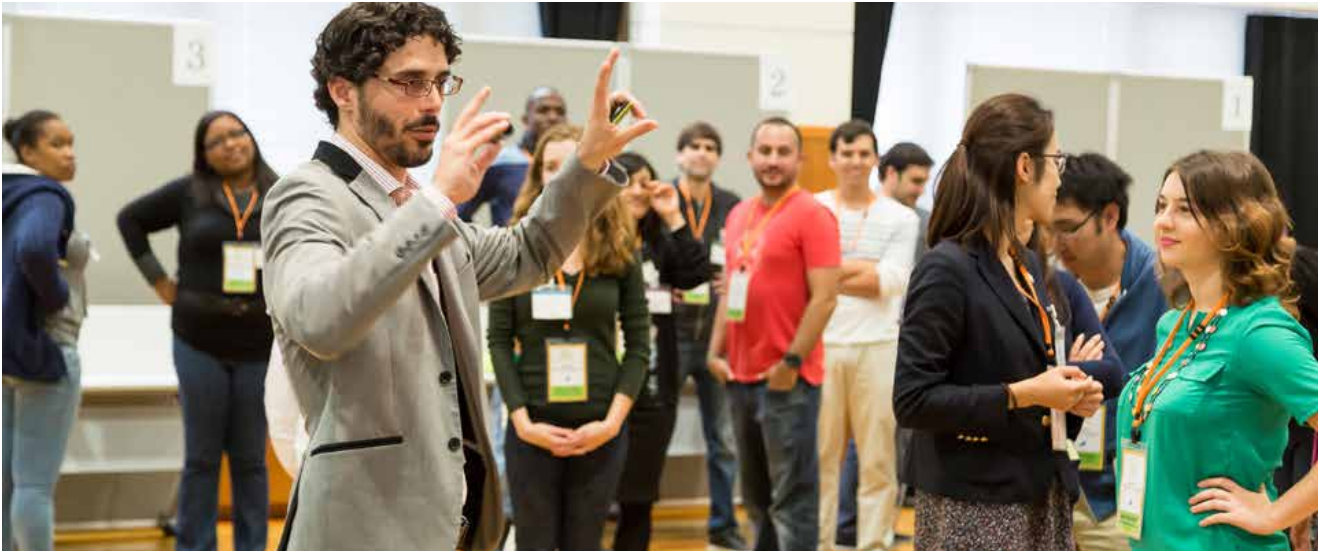
Making a "human world map" in an icebreaker