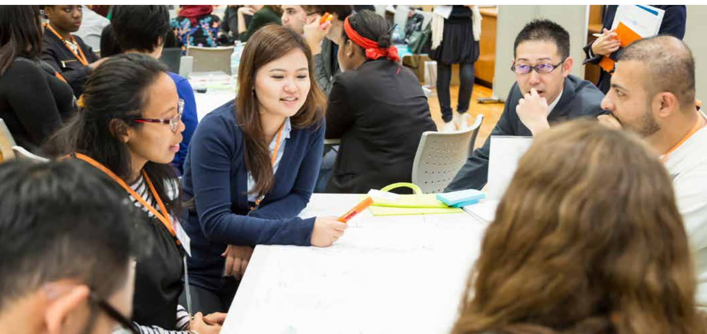
Drawing and sharing a vision for a sustainable future