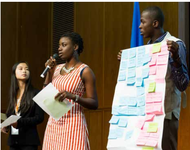
Discussion Group 6