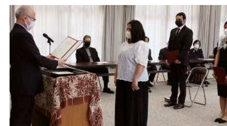
Certificate Awarding Ceremony

Students must buy National Health Insurance (about ¥2,500/m) and Comprehensive Insurance for Students Coupled with Personal Accident Insurance for Students Pursuing Education and Research (PAS) (about ¥3,000/y). Students also must have a chest X-ray taken in Japan.