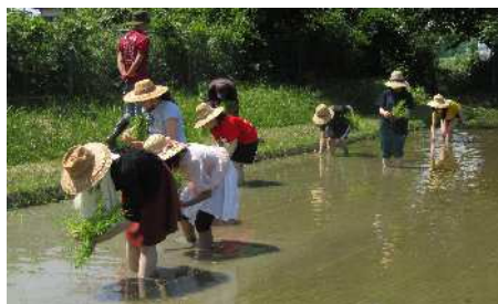
International Exchange event "rice planting" (2025)