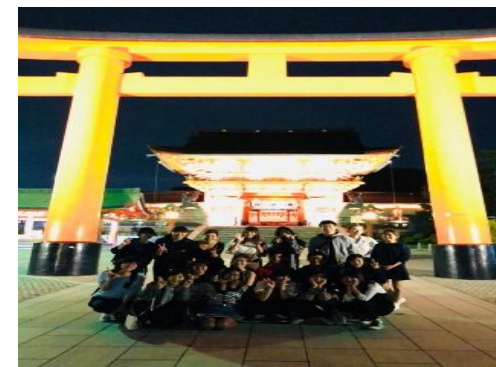
The campus is located near Fushimi-Inari Shrine, which is one of the most famous cultural spot in Kyoto. A scene from “Otsukimi(Moon watching) Party” organized by students in front of the shrine.