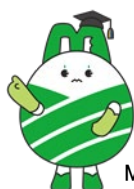
Mield (Mie University Mascot Character)