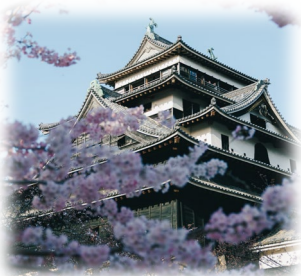
Matsue Castle (National Treasure)