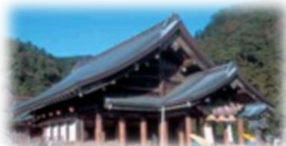
Izumo Taisha Shrine (National Treasure)