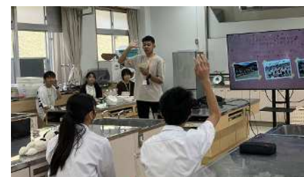
Summer school program for elementary and junior high school students in Soni village (2023)

*You can also join many events planned by the university or community organizations.