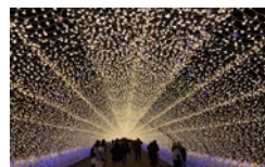
Nabana no Sato Flower Park