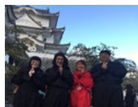
Iga Ueno Castle