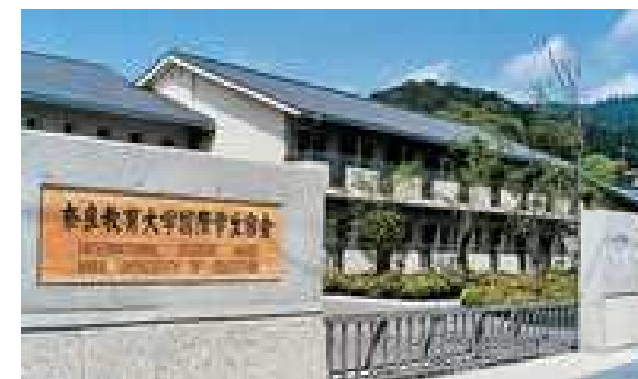
International Student House

※The Basic Japanese Language Course costs approximately ¥200,000 for a six-month stay in a dormitory at the JASSO Osaka Japanese Language Education Center. The commuting time to school is approximately 2 minutes on foot. If there are no vacancies in the JASSO dormitory, you will be placed in a flat arranged by JASSO or in our university dormitory. In this case, students will need to pay an additional transportation fee.