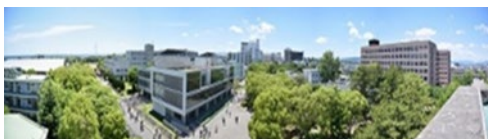
Kamihama Campus, Mie University