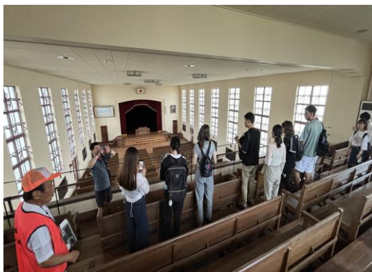
Field Study Programme on International Exchange (at facilities in Shiga Prefecture featured as anime filming locations)

Students may participate a field trip once a year with Japanese students. You can also visit local schools and enhance intercultural understanding with Japanese children through PICNIK program convened by Kyoto City International Foundation.