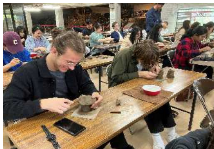
Field study trip to Wakayama (2024)