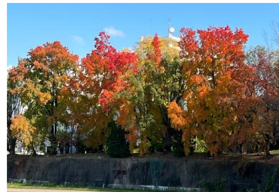
Autumn leaves of Hu(Formosa sweetgum) on campus.

URL : https://www.kyokyo-u.ac.jp/student/ehp/to-this/ttp/post-1.html