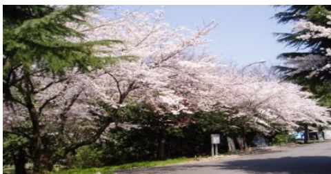
The campus is rich in nature. Cherry blossom is breathtakingly beautiful in spring.

The campus is the south of Kyoto City, a city that not only represents, as the old capital, Japanese traditional culture with its many World Heritage sites, cultural assets and rich spiritual culture, but also Japanese modern culture, with its famous Kyoto Station and Manga Museum—a city in which one can experience both historical and contemporary Japanese culture.