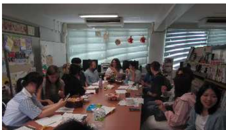
International Exchange event "Nakkyon's cafe" (2025)