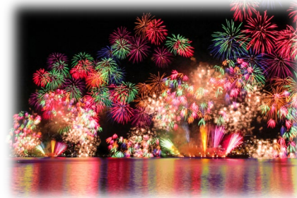
Matsue Suigosai Festival