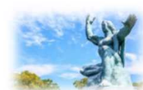
(一社)長崎県観光連盟

"Nagasaki University Global Alumni Network "are active in various regions around the world giving alumni an opportunity to network and advance in their careers.