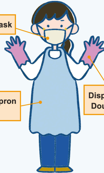
Disposable gloves Double the items