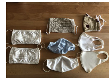
Figure 4. Masks as Connecting and Dividing Devices