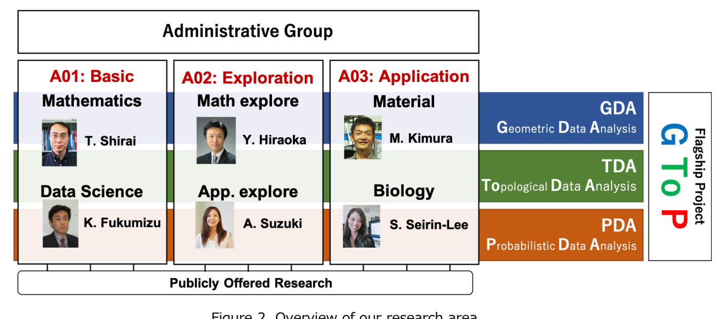
Figure 2. Overview of our research area