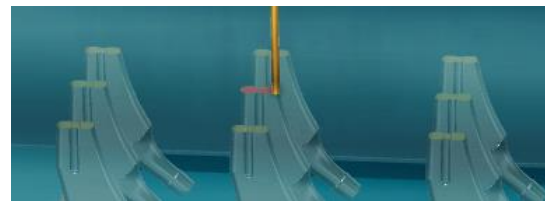
Fig. 2. 3D printing by crystal growth under superthermal field.

[Science for creation of super-titanium] Development of lightweight and heat-resistant super-titanium materials by controlling crystal orientation and microstructure using STFs. [Science for creation of biomaterials] Improvement of metallic implant devices by controlling mechanical biocompatibility through crystal orientation control of biomedical metallic materials (Figure 2) by using STF. [Science for creation of ceramic materials] Establishment of the academic basis for the fabrication of new ceramics materials by applying STF s to melt growth, gas phase growth, and solid particle deposition, direct observation of crystal growth front.