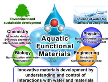
Figure 1. Fusion of sciences and engineering for the achievement of research in this project.

New principles of materials design are required to develop materials that exhibit high function in aquatic environments. We need to establish unified materials science based on understanding of structure-function relationship between water and substance. In conventional water science, structures and properties of water as single