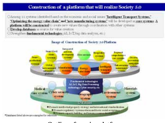
Outline of service platform

Toward realization of Society 5.0, the 5th Basic Plan intends to develop 11 systems<sup>1</sup> identified based on the economic and social issues ahead of other systems, steadily work toward their coordination and collaboration and construct a common framework for various services including new services that are not assumed now. To show examples of the 11 systems, MEXT developed Data Integration & Analysis System ( DIAS ) as a global environment