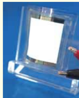
Flexible OLED lighting

While competition is becoming increasingly intense worldwide in the field of organic electronics, the Yamagata Organic Electronics Innovation Strategy Promotion Region promotes through industry-academia-government collaboration further advancement and commercialization of the general organic electronics technology fostered in the area, including OLED lighting technology, organic solar cells, and organic transistors (e.g., development of mass production technology for an innovative printing method in terms of easy operability and cost reduction), and aims to attract companies to the area through technology transfer efforts. With the Yamagata University Innovation Center for Organic Electronics, which begins full operation this year, at the center, the Yamagata Organic Electronics Innovation Strategy Promotion Region focuses on the establishment of the Yamagata innovation model from fiscal 2013 and strives to make the Yamagata area a "global center of organic electronics."