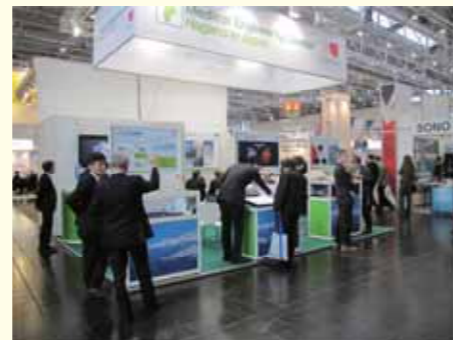
Nagano Booth at COMPAMED 2012 (Germany)

The "research-seeds-oriented industry-academia-government collaboration support system", which combines material technology seeds of knowledge-rich institutions such as Shinshu University and Nagano Prefecture's acclaimed ultra-precision technology, was added with a "market-needs-oriented product commercialization promotion system" for the development of medical modules/equipment that meet the clinical medical needs of university hospitals and others. The revamped industry-academia-government collaboration support system aims to accelerate the establishment of the Nagano Super Module Supply Hub for Next-Generation Industries in the greater Nagano Prefecture. This region is focused on promoting international activities, such as sales of superb technologies possessed by local companies, such as ultrahigh-speed PCR equipment, high-sensitivity clinical examination systems utilizing fluorescent magnetic beads, and other medical equipment developed and commercialized in the region, and the establishment of a network connecting to overseas universities and research organizations, with the aim of creating an internationally competitive center for the medical equipment industry.