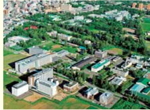
Hokkaido University Research & Business Park

The Hokkaido University Research & Business Park, which is composed of 16 research institutes engaged primarily in life science research, has been addressing the creation of a health science industry by forming a hub to analyze and evaluate the functionalities of food and by enhancing the added values of regional foodstuffs. In addition, it also aims to form an innovation hub for the development of world-leading medical technologies and new drugs as well as for the integration of health science and medical technology with a focus on the bio-functionalities of food, by maximizing accumulated knowledge and technologies. Furthermore, the Hokkaido University Research & Business Park promotes "health innovation" aimed at maintaining, promoting, and restoring people's general health condition, such as medical tourism and fitness backed by the most advanced medical technology, in order to contribute to creating a health-longevity society.