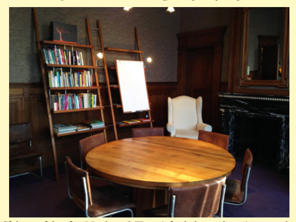
Shipyard in the National Tax Administration Agency in the Netherlands (Lighting and interior are designed for facilitating the presentation of ideas and concentration)

involving stakeholders 1. As a specific approach to promote interactive policy-making, a (permanent) space is provided in the central bureaucracy to encourage communications in the U.K., Netherlands and other European nations. It is intended to encourage staff to change their daily mindset and present new ideas and intention for total optimization to facilitate project progress. In the National Tax Agency in the Netherlands, for example, policies for improving tax collection, which is becoming difficult in complicated modern society, are proposed in the interactive policy-making system. Additionally, the Ministry of Infrastructure and the Environment of this country succeeded in significantly shortening the period from planning to implementation of a plan to construct a canal by making the plan together with stakeholders.