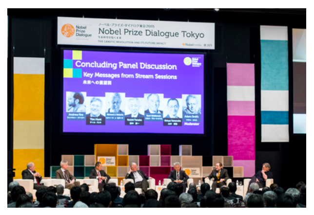
Nobel Prize Dialogue Tokyo 2015

MAFF provides producers and consumers with information and opportunities to exchange