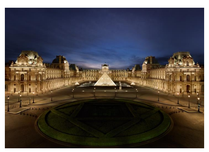
Louvre Museum Lighting Refurbishment Project

Ultra-fine brightness control of LED lights is possible by combining the three primary colors, red, green and blue LEDs with a microprocessor, which enhances the lighting performance by increasing the number of reproducible colors and promptly changing colors, such as in decorative and visually appealing illuminations, e.g. beautiful winter illuminations in various areas.