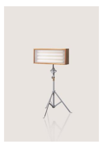
The first domestic fluorescent light

The fluorescent lamp was sold in Japan in the 1940s. The first president of Tokyo Shibaura Electric Co, Ltd. (currently TOSHIBA Corp.) visited GE to inspect the fluorescent light and subsequently sent three engineers to GE in 1939 in order to commercialize the fluorescent light business in Japan. Next year, in 1940, the company succeeded in manufacturing a small quantity of fluorescent lights and on August 27th the same year, these sample products were used in the Horyuji Mural Painting Reproduction Project to commemorate the 2,600th year of the founding of Japan. This is a memorial day for the debut of fluorescent lights in Japan. Following continuous improvements, domestic fluorescent lights finally reached international standards of brightness in 1951, while the average service life reached 7,500 hours in 1954, on a par with foreign counterparts.