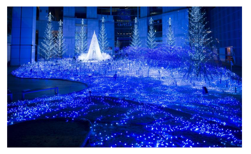
About 250,000 blue LED light bulbs used for illumination

LEDs are also used in the medical fields, where compact, slim and light LEDs allow highly flexible equipment design and formation. One example of a product making the most of these features is the capsule endoscope, inserted orally into the patient's body to take internal images. The smaller the endoscope is, the less stressful to the patient. LED lighting devices can be designed in a compact form and with a smaller battery for energizing low-power LEDs, making them ideal lighting for capsule endoscopes.