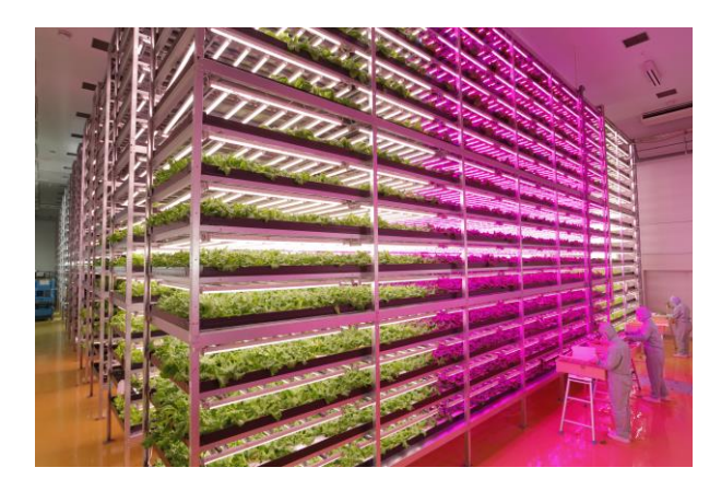
All LED artificial light-based plant factory