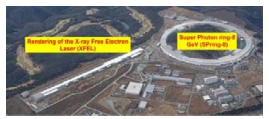
X-ray Free Electron Laser (XFEL) facility [The rectangular-shaped building at left is XFEL. The circular-shaped building is the Super Photon ring-8 GeV (SPring-8)] (January 2009)

The X-ray free electron laser (XFEL) facility is oscillating the ultimate light combining features of laser and radiation light, and is a world cutting-edge base research facility that makes it possible to carry out analysis that was impossible with conventional measures. The aforementioned facility will enable instantaneous measurement and analysis of ultra-microstructures at the atomic level and super-high-speed movement or changes in chemical reactions and is expected to offer innovative results in a wide range of research field including development of medical supplies and fuel cells, and clarification of mechanism of photosynthesis. The construction of XFEL has completed in September 2010 and conducting test operations for its shared use which is expected to start in March 2012. In addition, the name was decided as "SACLA" in March 2011. (Refer to Part 2, Chapter 2, Section 2, 4.)