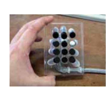
Multi-channel sensor pad Equipme

4. Measurement of urine flow by ultrasonic wave The measurement method is developed to almost accurately identify the shape of organs such as bladder in a limited space, as well as its measurement device. The system to control urine disorders and the ultrasonic sensor pad are also developed. For connection of human body and sound, the ultrasonic sensor and the film-type echo gel are also developed.