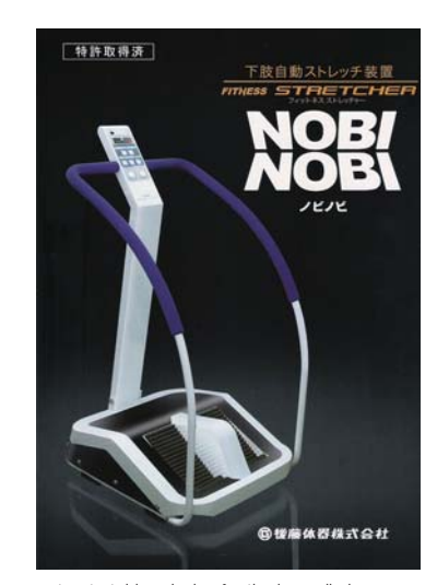
auto-stretching device for the lower limbs

An adequate amount of nitrate (NO3-) is required for plant growth. However, the transformation of nitrate (NO<sup>3-</sup>) into nitrite (NO<sup>2-</sup>) has been identified as a potential hazard to human health. The amount of residual nitrate in vegetables should therefore be minimized as much as possible. This study focused on aqueous solutions as foliar spray that can reduce the nitrate content in vegetables and simultaneously increase the level of antioxidants such as vitamin C and polyphenol. This study formulated the target solution, and then commercialized it as several foliar sprays. Over the course of development, we carefully estimated how the developed foliar sprays affect "food safety" marketing, with the cooperation of farmers and a large supermarket.