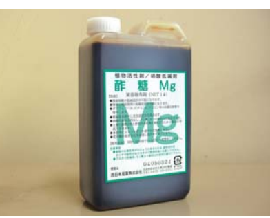
SAKUTOU Mg (a foliar spray solution as a nitrate reducer)