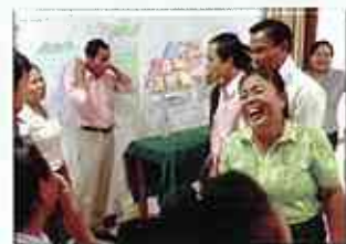
Joint Programme with Laos NatCom, 2012

Training Workshop for Pacific Region NatComs