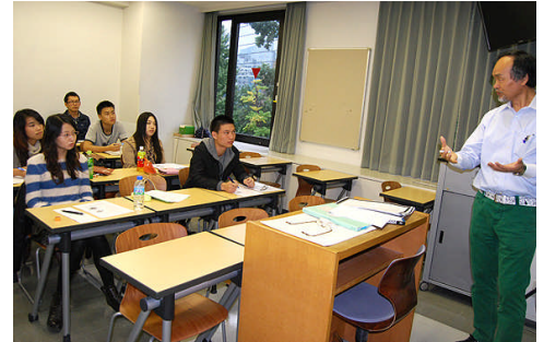
A class at new program in environmental studies