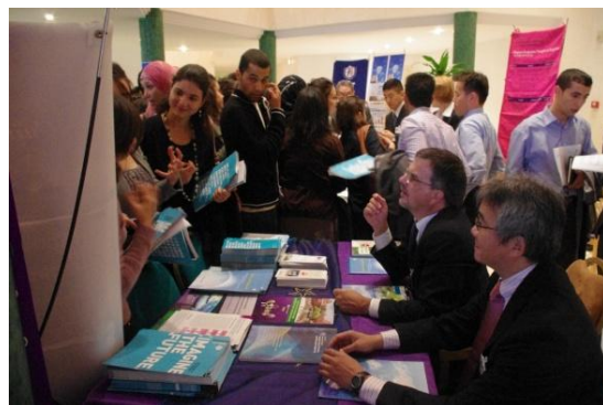
< Study in Japan Fair (Hammamet, Tunisia – Nov. 2011) >