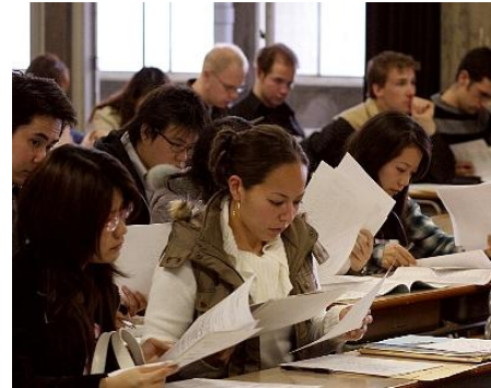
Double Degree Program between Graduate School of Economics and Sciences Po (France)