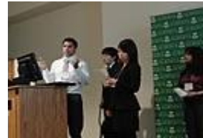
Japan-Canada Academic Consortium Student Forum 2011 in Canada

15 students from 11 Japanese universities and 15 students from 8 Canadian universities will participate in Japan-Canada Academic Consortium Student Forum in Kyoto, Japan, in February 2012.