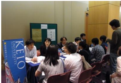
Introducing Keio University at an International Education Fair