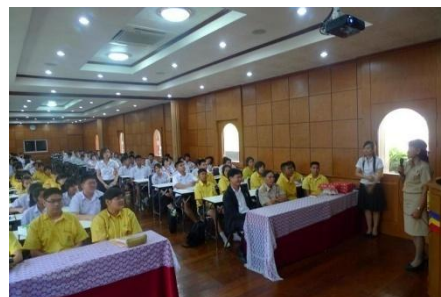
〈Promotional event at high school in Indonesia〉