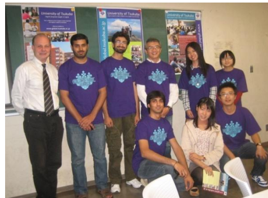
< Introduction booth for English program with students and faculty at the 2011 university festival >

○ Study in Japan Fairs with nation-wide participation of Japanese universities: November 2011 in Tunisia, March 2012 in Morocco (as part of the 2011 academic year).