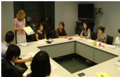
English Skill Development Course for Administrative Staff