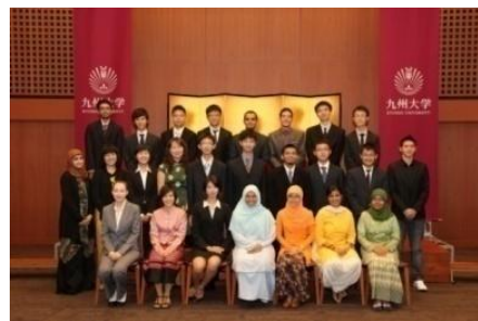
〈Entrance Ceremony: International Undergraduate Program〉

We offer unique student exchange programs such as JTW (Japan in Today's World), ATW (Asia in Today's World), and AsTW (ASEAN in Today's World). We administer double degree programs jointly with such eminent institutions as Lund University, Sweden and Renmin University, China. Our schools and graduate schools have concluded 216 exchange agreements to promote student exchange. In addition, we set up EU Institute in Japan , Kyushu in association with Seinan Gakuin University and Fukuoka Women's University with the aim of promoting educational collaboration and student exchange with universities in EU countries.