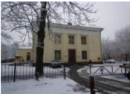
Japanese Inter-University Russia Office (MSU campus)