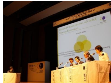
International Symposium “For the Development of Global Competency” held at Meiji University

Utilized the JTB's overseas shared office as the satellite office of Meiji University in Beijing since April 2011, to survey current situation of high schools, Japanese language education and study abroad.