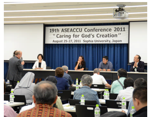
Participants actively exchanged ideas at the conference

→ The number of Sophia students abroad increased from 584 students in 2010 to 666 in 2011.