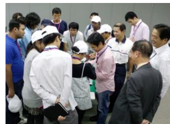
<Speaking with company researchers about products>

On September 28, 2011, Kyoto University, Doshisha University and Ritsumeikan University arranged to have factory tours for international students who are interested in finding a job in Japan. Participants visited two local manufacturing companies: a leader in measuring instruments and another in seatbelts. Both the student participants and company representatives expressed the need for more similar opportunities in the future.