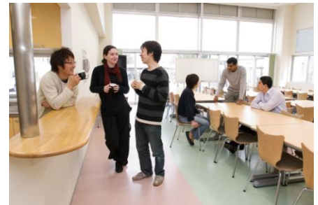
(University House Sanjo)

This institute was established in November 2009. Its purpose is to enhance the university's international education environment by planning, implementing and supporting courses taught in English under Global 30. At the same time, the Global 30 Promotion Center was established to improve the project's organization.