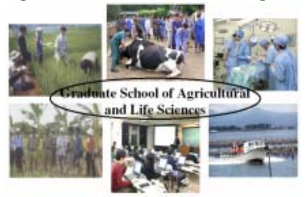
Fig 1: The Graduate School of Agricultural and Life Sciences- present status