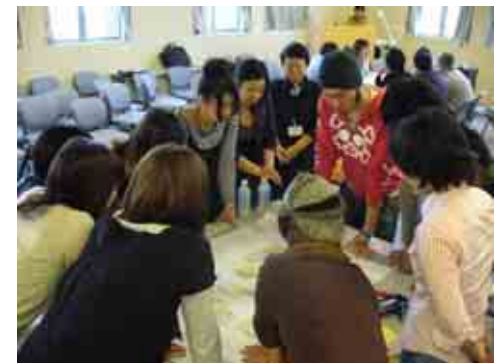
“University Student Eco Network Café in Yokohama” (October. 2007)