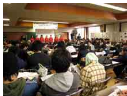
Picture2: Kyoyama ESD Festival