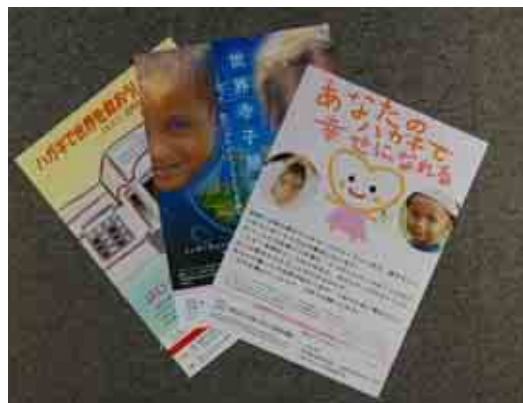
Leaflets made by students

In the project, volunteer members of UNESCO associations visit schools to lecture on WTM activities, so that Japanese students can deepen their awareness and understanding of children in developing countries who do not share the same educational opportunities. As the outcome of the project, students design and distribute leaflets that explain the disadvantages faced by many children in the world and call for support from the WTM.