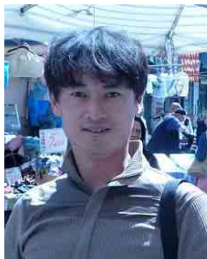
Yokohama RCE Network Promotion Commission Secretariat

As an example of the effects of such networks, pamphlets introducing RCE Yokohama, principally based around university students, were created.