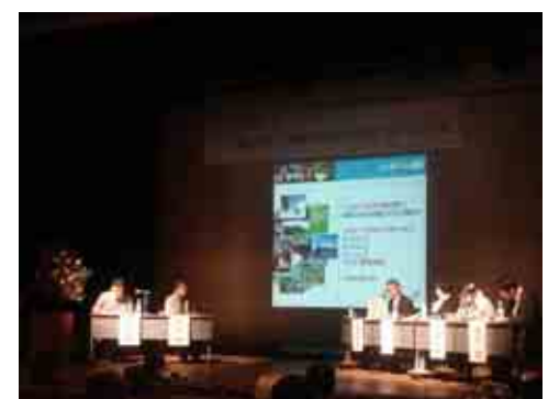
Community Symposium “From Yokohama!! Action for Sustainable Community” (March 2008)

In 2008, RCE Yokohama is planning to hold workshops for young leaders of groups in order to learn know-how to stimulate their own activities, to call for universities in Yokohama to operate chain of moves on environmental activities, and to hold a symposium to facilitate the exchange of information.