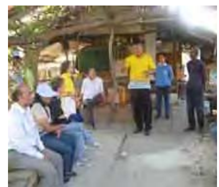
COE members learning from village leader about organic farming