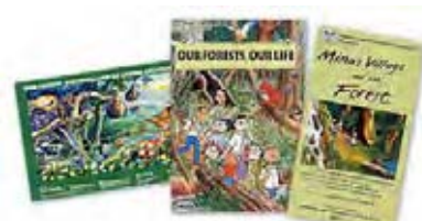
PLANET on forest management

Since 1997, ACCU has been producing Package Learning Materials on Environment (PLANET) in cooperation with educational professionals, animation creators, and UNESCO so as to stress the importance of environment and the harmonious relationship between humans and nature. PLANET series so far covered such themes as water pollution, forest management, waste management, and disaster preparedness. PLANET reaches children and adults in and out of school in many Asia-Pacific countries as the national versions in local languages have been produced in these countries.