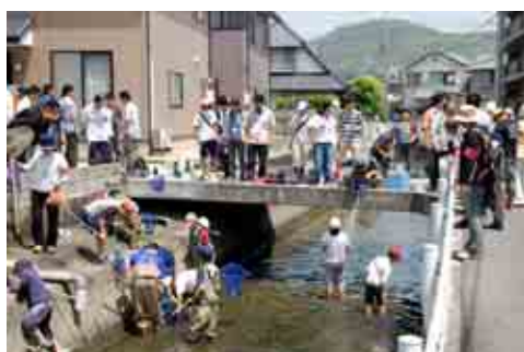
Picture1: Environmental Checkup by the participants from various generations.