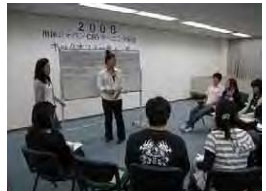
CSO Learning Program kick-off meeting