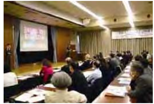
“Public Seminars on the Environment,” 15 th Anniversary Symposium (held on December 8, 2007)