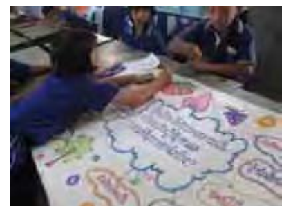
Participatory Learning in Innovation Project, Thailand

The overall objective of the Innovation Programme, is to initiate and to support projects that will serve as good examples for the implementation and promotion of ESD in the Asia-Pacific region. Ten projects in ten Asia-Pacific countries, both formal and non-formal education, have been supported for the last two years. The programme has been supported by the UNESCO/Japan Funds-in-Trust for ESD, and ACCU has been designated as a secretariat since 2005.