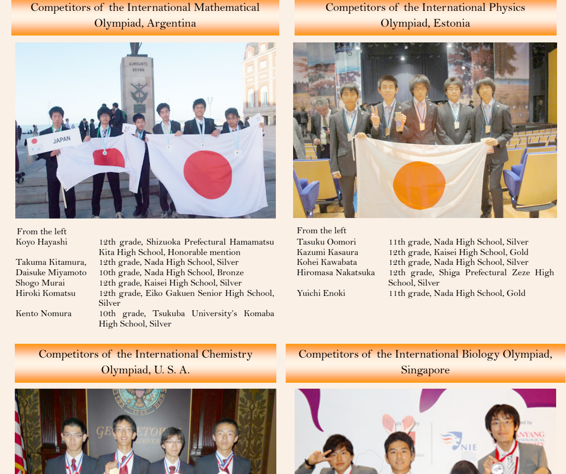
Figure 2-4-4/ Prize Winners of the International Science and Technology Contest in FY 2012