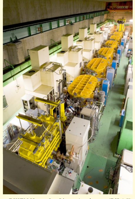
RIKEN Heavy-Ion Linear Accelerator (RILAC)