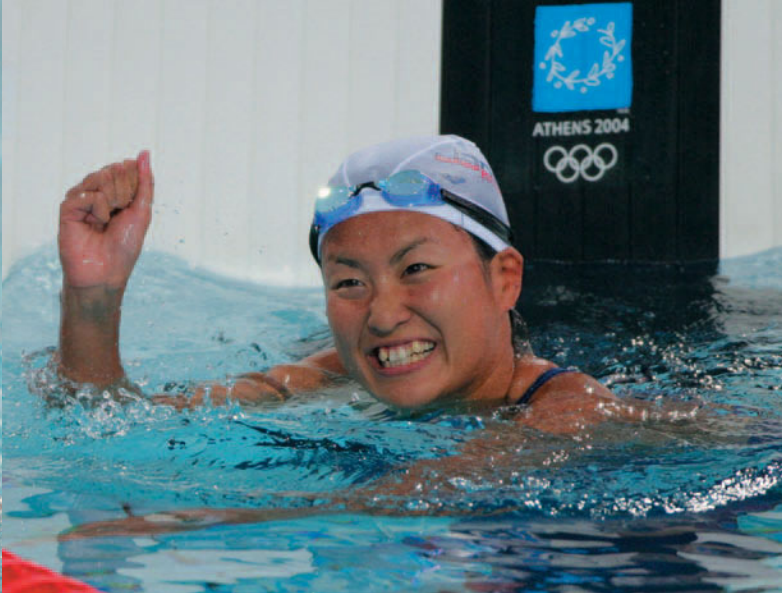
Ai Shibata, women's 800 freestyle swimming gold medalist, was the first Japanese to win a gold medal for the women's 800-m freestyle swimming.

"I stood on the starting platform, thinking I would definitely win."