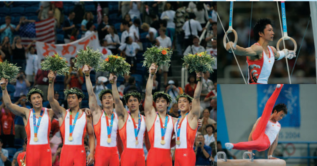
Japan's men's artistic gymnastics team winning a gold medal in team competition for the first time in 28 years since the 1976 Montreal Olympic Games