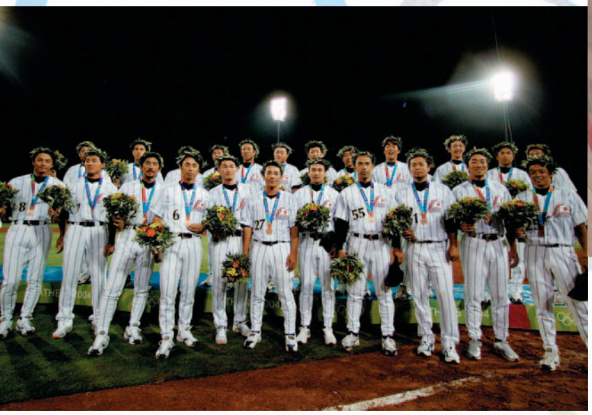
The baseball team, members of which were all professional baseball players, won a bronze medal.