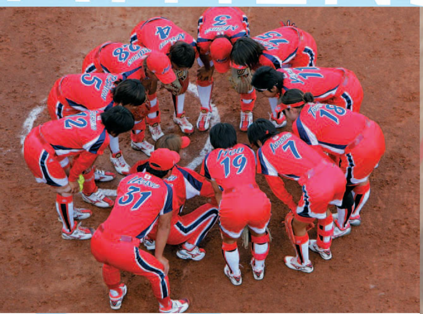
The women's softball team won a bronze medal, the second consecutive medal following the 2000 Sydney Olympic Games, where they won the silver medal.