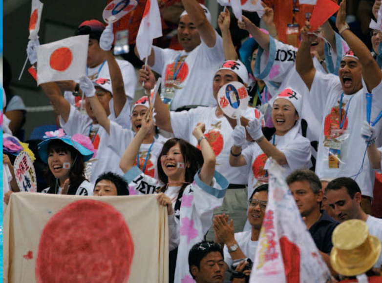
Cheerleading group excited at the performance of Japanese wrestlers.