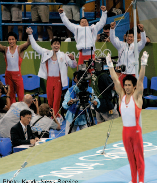
Japan's men's artistic gymnastics team winning a gold medal in team competition for the first time in 28 years since the 1976 Montreal Olympic Games

At the Athens Olympic Games, held on August 13 – 29, 2004 Japan won a record number of medals, exceeding the 32 medals won at the Los Angeles Olympic Games in 1984. The entire nation got excited at the performance of the Japanese athletes at the great Olympic Games.