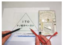
ITO nanoparticle paste for use in screen printing