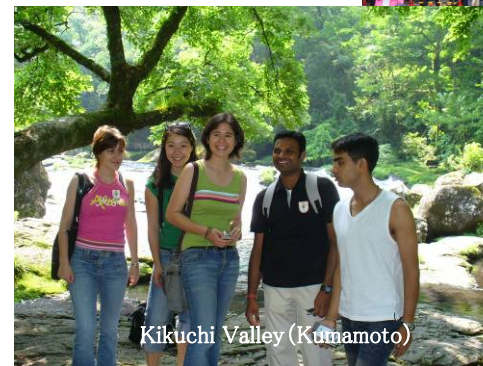
Kikuchi Valley (Kumamoto)