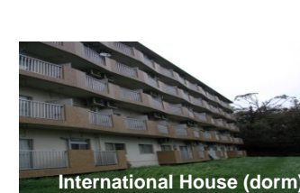
International House (dorm)

Living in this dormitory has enabled students on the program to be able to concentrate on their studies.