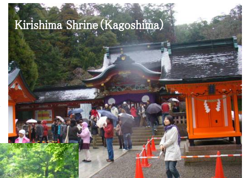
Kirishima Shrine (Kagoshima)