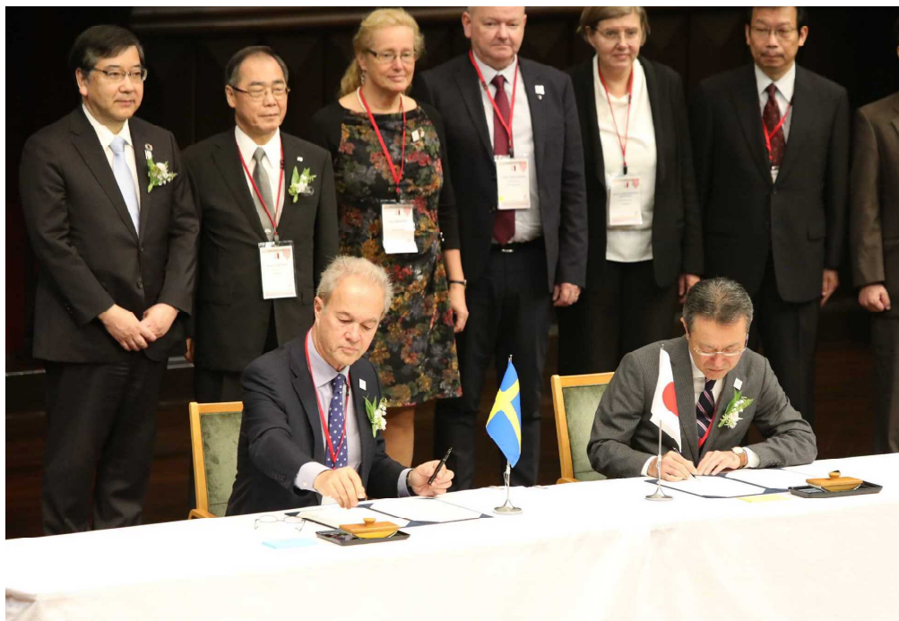
< 署名時の様子 >

(例えば、二国間の国際共同研究の推奨・実施に向け、日本の SPring-8 とスウェーデンの放射光施設でのビームタイム交換を含む共同プログラムの協議開始やファンディング機関の協力について盛り込まれている。)