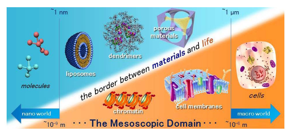
Figure. Research fields of "Meso-scopic" science in materials science and cell biology.

For example, studies of chemical biology, extracellular matrix, in vitro differentiation induction of germ cells, carcinogenesis by reprograming factors, neural stem cells, and so on.