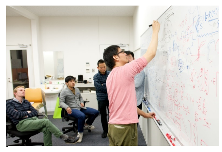
Figure. "Interface" group consisting of 7 young theorists and mathematicians, connecting between traditional materials science and mathematics.

successfully developed, and AIMR is now internationally well recognized as the first institute to promote Math-mate collaboration at an institutional level. It is expected to pioneer new materials science.