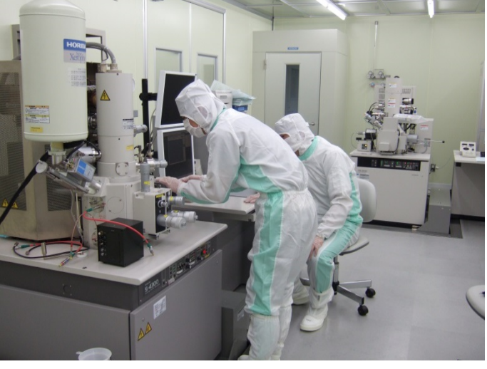
Figure. MANA Foundry